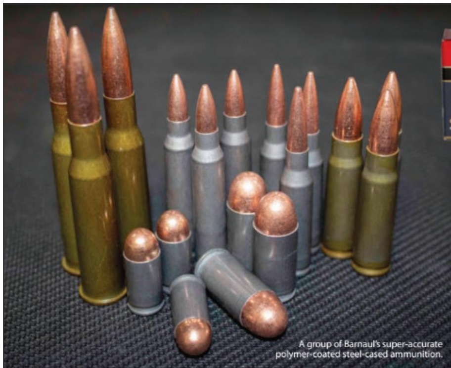
A group of Barnaul's super-accurate polymer-coated steel-cased ammunition.